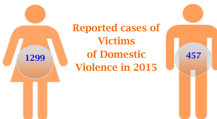
Victims of Domestic Violence by sex, 2010-2015 (Reported Cases)

Below mentioned figure shows the registered cases of domestic violence in the period 2010-2015 in the age group 0-80 years and older. The increased number of domestic violence from 2013 for both men and women is striking. In 2015, the number of registered cases of domestic violence against women decreased, but that does not necessarily mean that violence itself has declined.